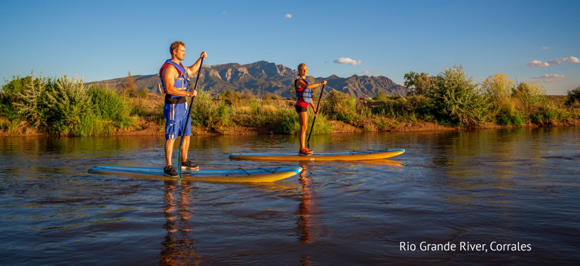
Rio Grande River, Corrales