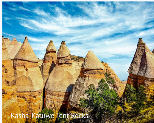
Kasha-Katuwe Tent Rocks