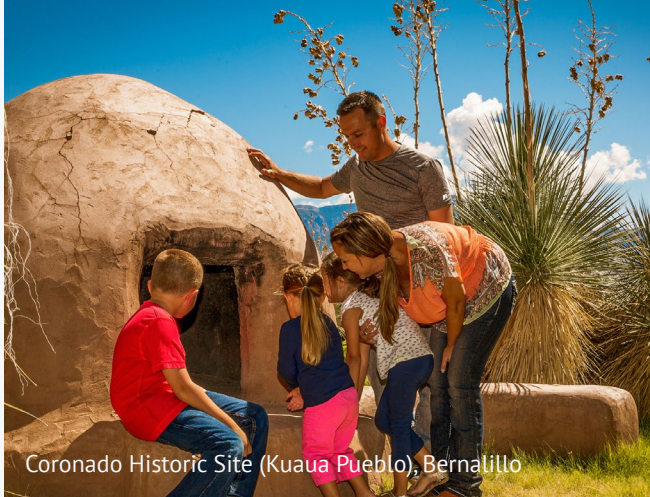
Coronado Historic Site (Kuaau Pueblo), Bernalillo