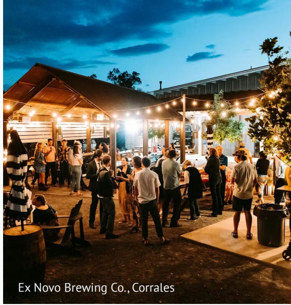
Ex Novo Brewing Co., Corrales