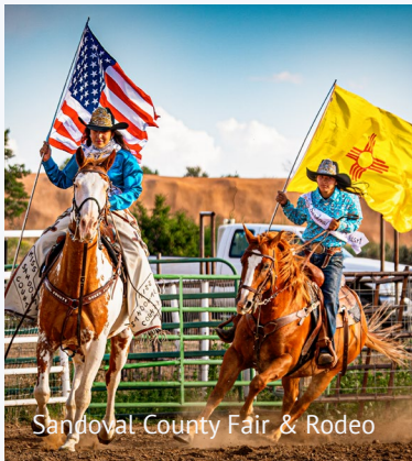
Sandoval County Fair & Rodeo