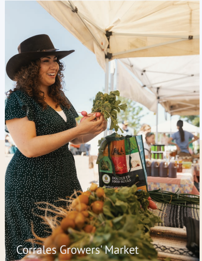
Corrales Growers' Market