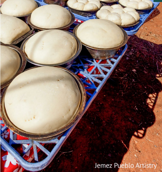
Jemez Pueblo Artistry

Visitors can experience this vibrant culture through each community's art, pottery, weaving, and jewelry, which tell the stories of the land and its people.