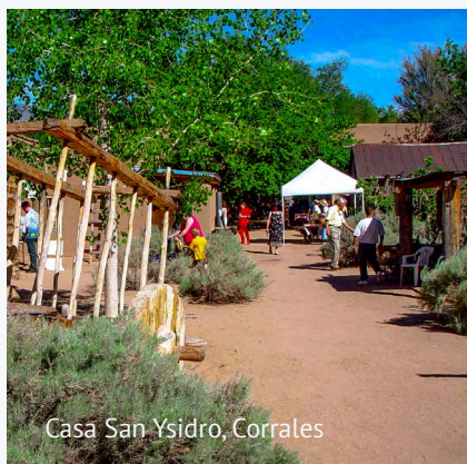
Casa San Ysidro, Corrales