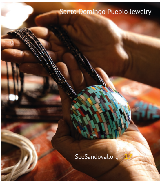
Santo Domingo Pueblo Jewelry