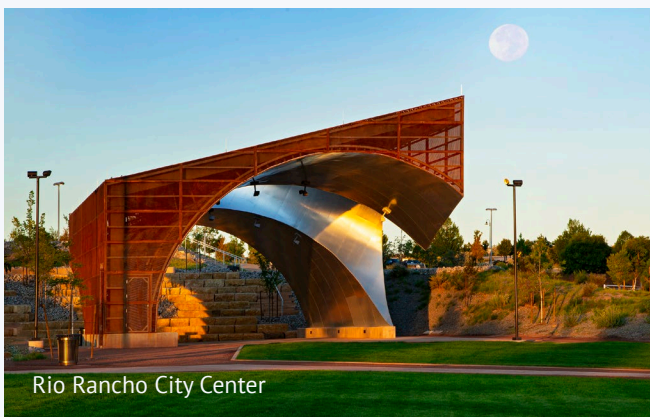
Rio Rancho City Center