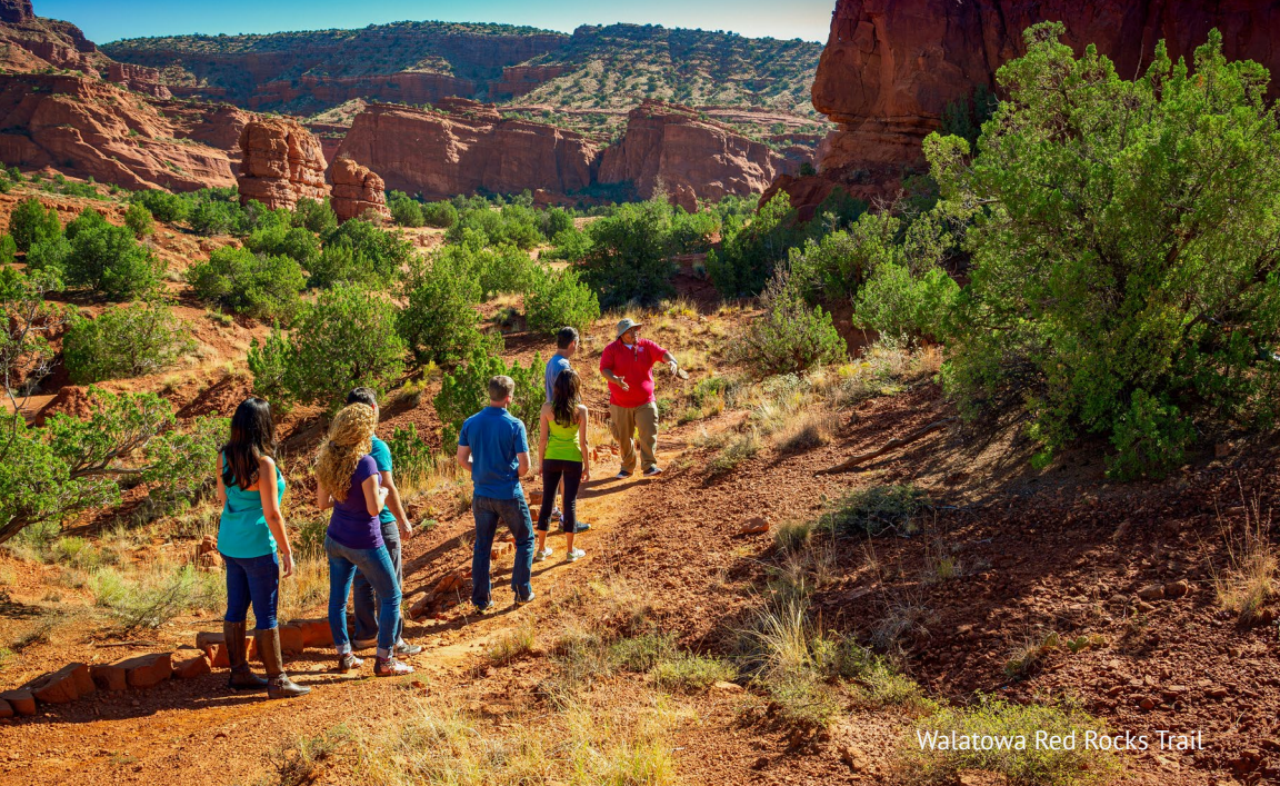
Walatowa Red Rocks Trail