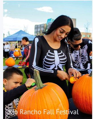
Rio Rancho Fall Festival