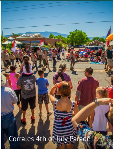
Corrales 4th of July Parade