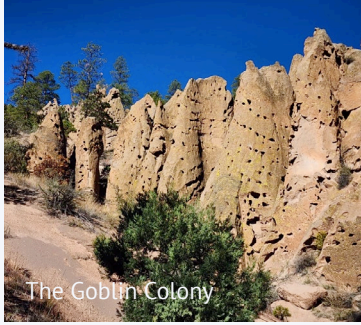
The Goblin Colony