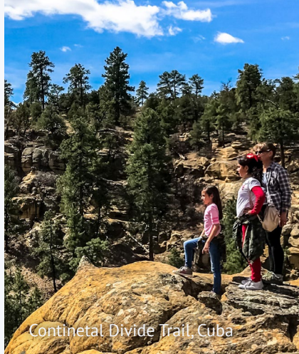
Continental Divide Trail, Cuba