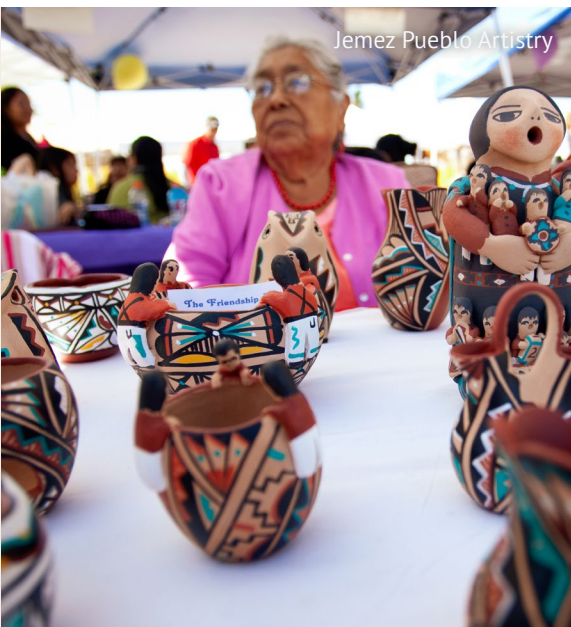
Jemez Pueblo Artistry