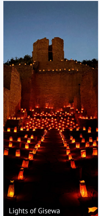
Lights of Gisewa