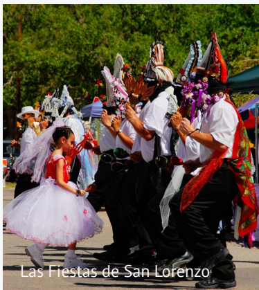
Las Fiestas de San Lorenzo