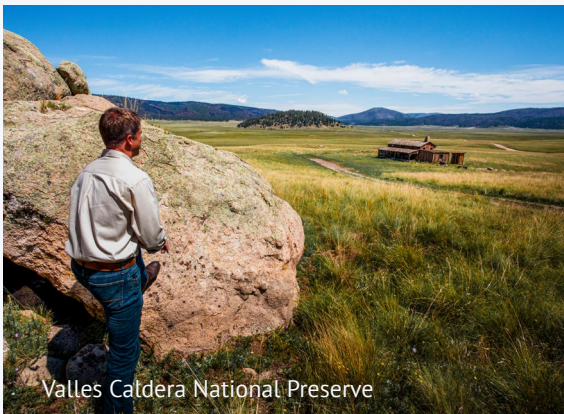
Valles Caldera National Preserve