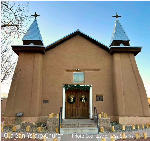
Old San Ysidro Church

Hit up the Saturday market (April-October) or explore the food and beverage scene along Corrales road.