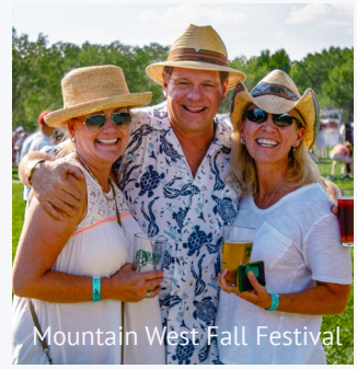
Mountain West Fall Festival

Hundreds of farolitos illuminate the ancient paths of Giusewa Pueblo and San José de los Jémez Mission. This beloved celebration honors New Mexico holiday traditions with bonfires, music, and storytelling beneath the winter stars.