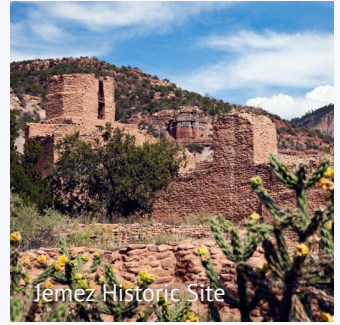
Jemez Historic Site